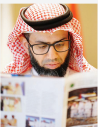
Abdullah Omar Al-Tamimi Courses of Conferences Sessions & seminars